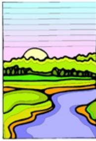
in the morning